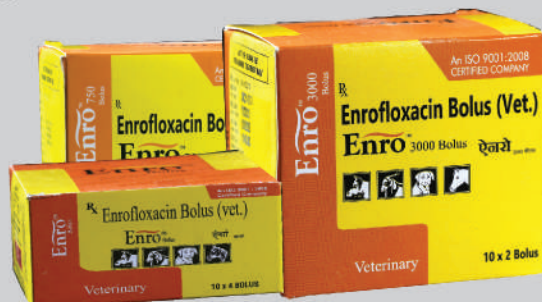
Enro 750 mg, 1500 mg & 3000 mg Bolus