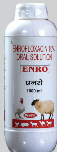
Enro Oral 100 ml & 1 Ltr