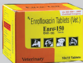
Enro 150 mg Tablets